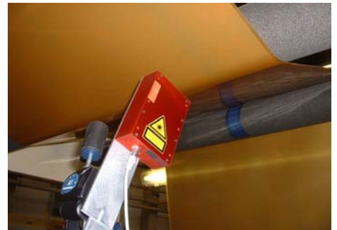
Figure 2: Resulting length

Length measurement for a precise cutting of web material. The material surface stays untouched, thus slippage, day to day wear problems and measurement traces are avoided.