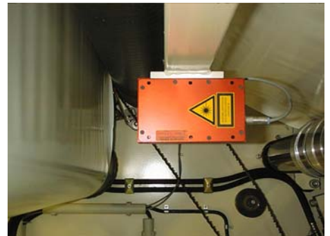
Figure 1: Cut-to-length control

Length measurement for a precise cutting of web material. The material surface stays untouched, thus slippage, day to day wear problems and measurement traces are avoided.