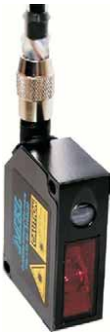
Sensor head M1 /20 /100 /200 /400 Weight 100 g

Low cost Distance measuring with Laser 100 values / s Triangulation analog